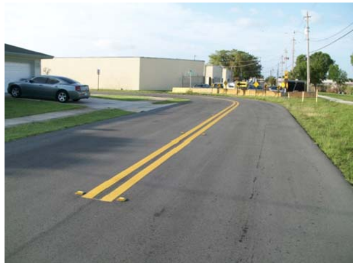
AFTER HARLEM McBRIDE NE 34 Court/NE 3rd Avenue

Future targeted neighborhoods for road resurfacing will be presented to City Commission for approval in October 2010 and will include streets in Lloyd Estates and Prospect Gardens — taking into consideration all roadways that have two-inch water mains cannot be resurfaced until the Water System Improvements have been completed.