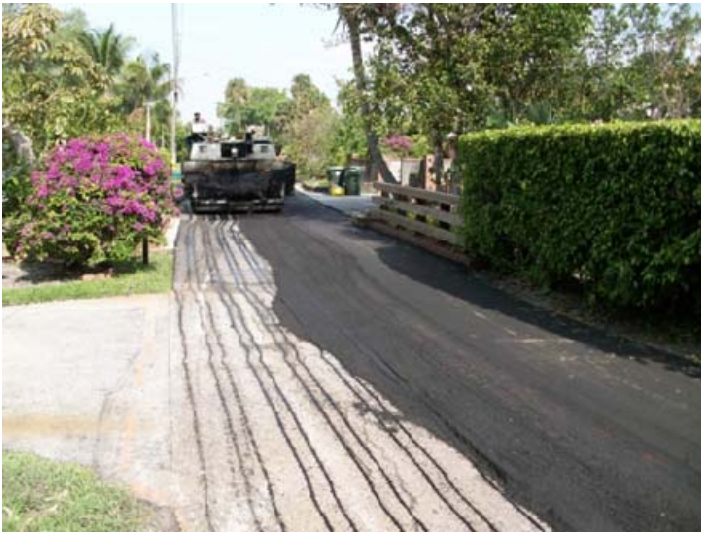
BEFORE SLEEPY RIVER BRIDGE NW 32 Court