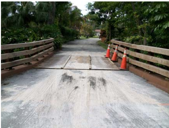
BEFORE SLEEPY RIVER BRIDGE NW 3rd Avenue

The Fiscal Year 2010 road resurfacing Capital Improvement Program (CIP) project budgeted at $147,670 for Sleepy River, as well as portions of Harlem McBride has been completed. All of the Harlem McBride community has been resurfaced with the exception of NE 35 th Street and NE 36 Street which will be resurfaced after Water System Improvements have been made. Road resurfacing areas had to be revised after Commission approval of the Water System Improvements. Public Works adjusting the planning as it would not be fiscally reasonable to resurface roadways that would be torn up within the next five years for water system improvements. Recent areas resurfaced (in Fiscal Year 2009) included sections of Harlem McBride and the South Corals, and an area around Oakland Park Elementary School in Central Oakland Park. Road resurfacing is a one-inch overlay of asphalt that once applied should last for 10 to 15 years. Once the resurfacing has cured for 30 days, thermoplastic striping and reflective roadway pavement markers are added for definition of the radiuses at intersections.