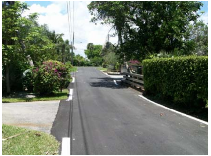
AFTER SLEEPY RIVER BRIDGE NW 32 Court