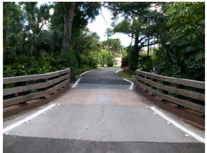
AFTER SLEEPY RIVER BRIDGE NW 3rd Avenue