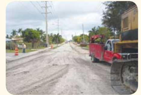
Looking east on NW 38 Street/Park Lane West from Powerline Rd.

The Lloyd Estates Residential & Industrial (LERI) Drainage Project has been designed to provide drainage improvement to NW 38, 39 and 40 Streets between North Andrews Avenue and Powerline Road and on NW 10 Avenue and side streets between